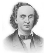
Missouri Governor Claiborne Fox Jackson, January 1861